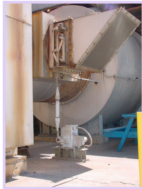
i.e. Beck rotary 11-409 [Melt Shop Fume Control Tempering Air Damper]

The performance of Beck drives continues to be outstanding, which has led to an additional 70+ drives being specified between 2004-2011.