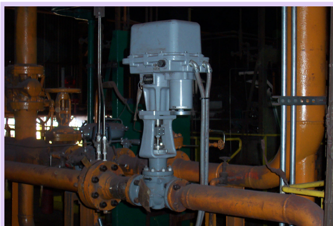
Typical Extractor Gas Valve, Beck linear 29-109

Beck drives were purchased for replacement because they can modulate continuously while providing precision accuracy and repeatability for valve and damper positioning. The equipment was installed in October 2003. The Beck drives at this mill continue to be outstanding and many more drives were specified between 2004-2011.